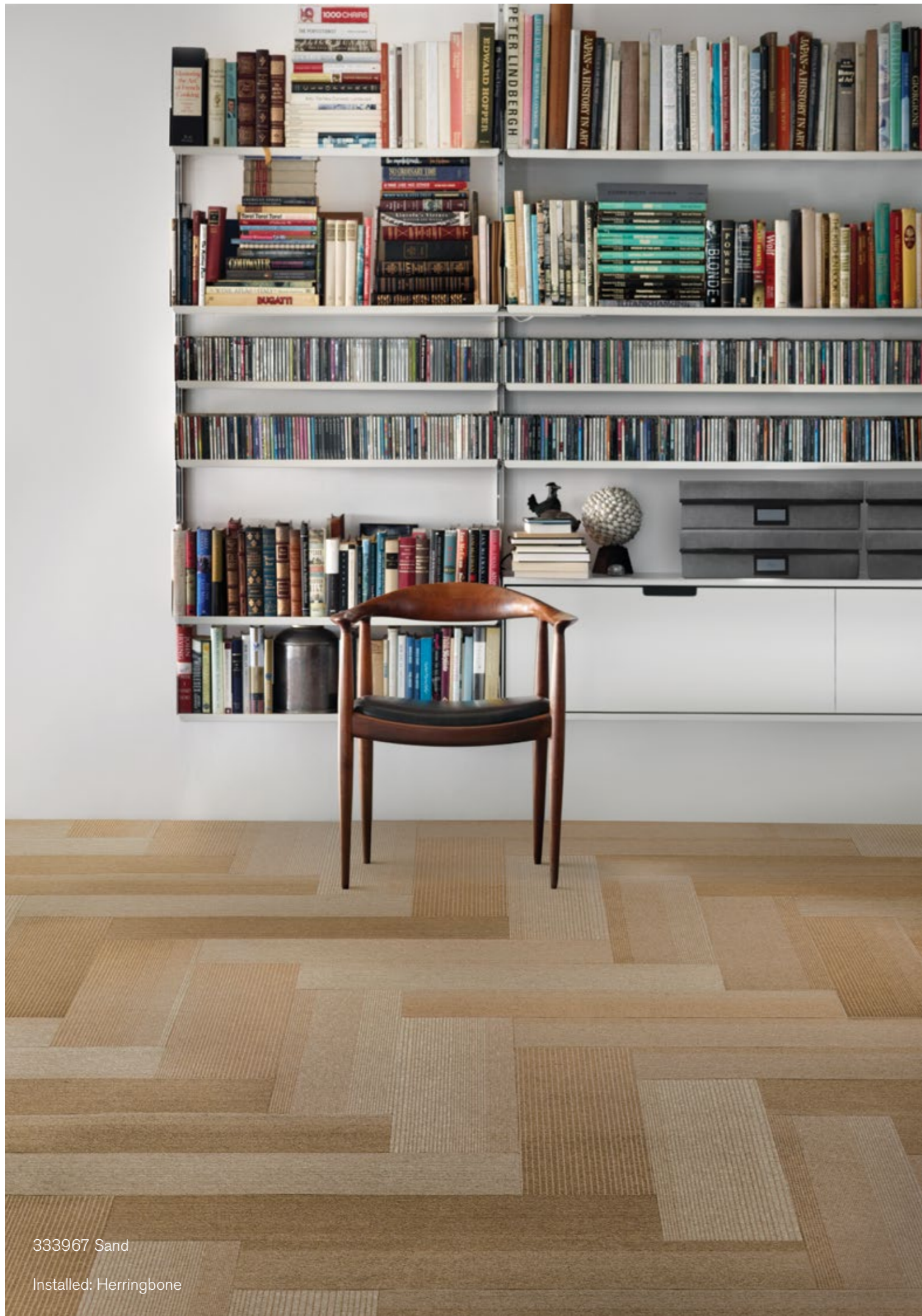
333967 Sand Installed: Herringbone