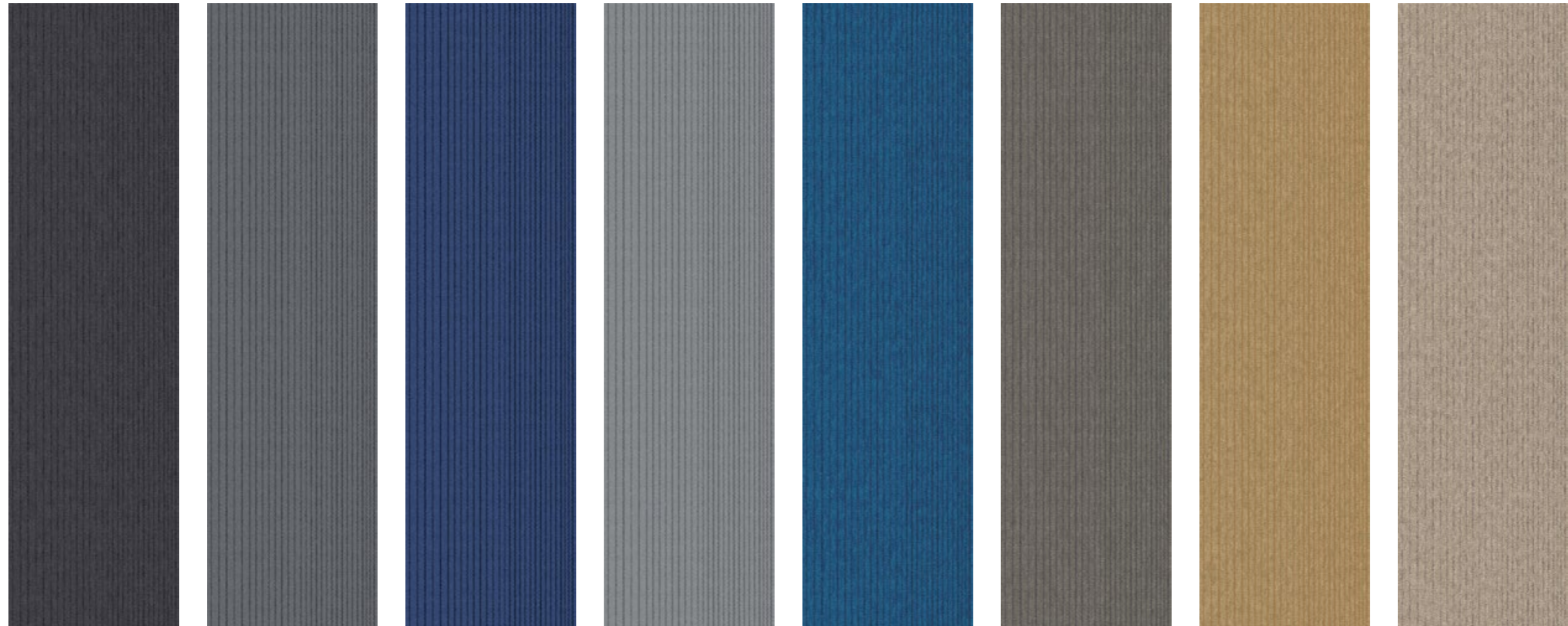
333961 Black Sea