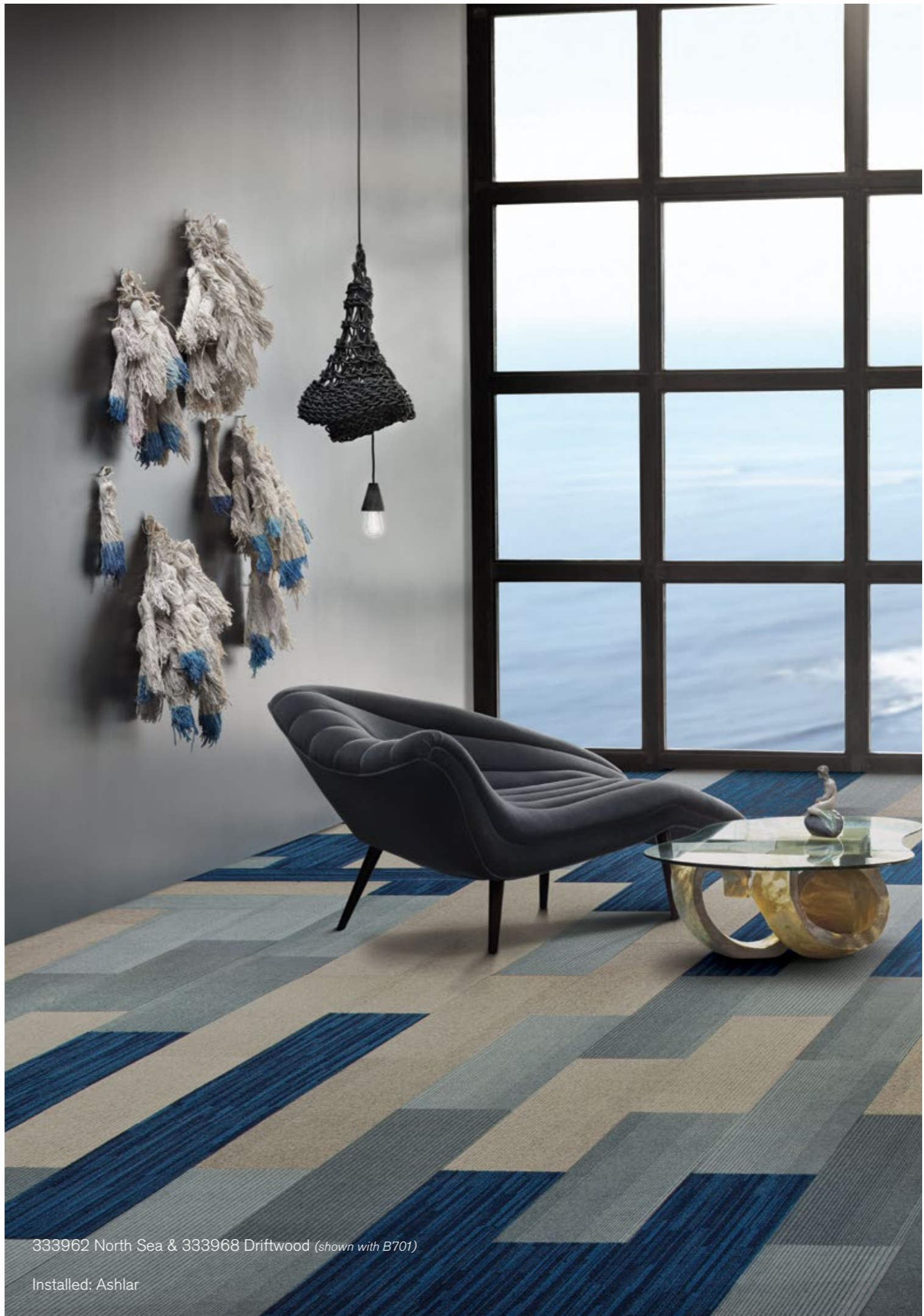
333962 North Sea & 333968 Driftwood (shown with B701) Installed: Ashlar